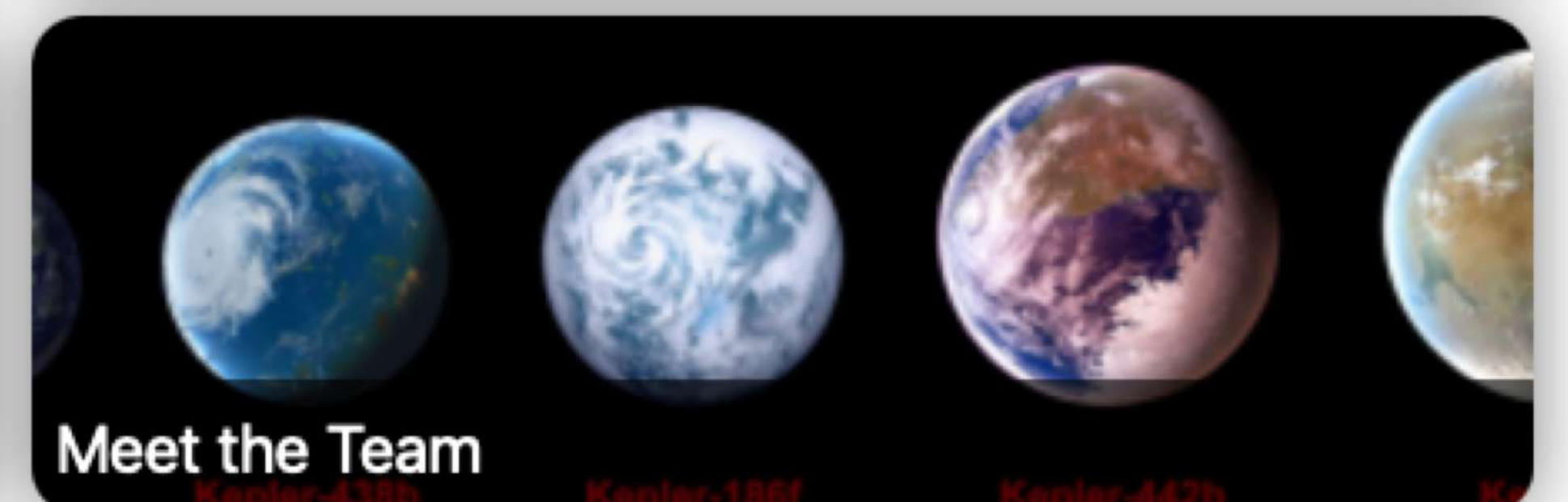
Meet the Team