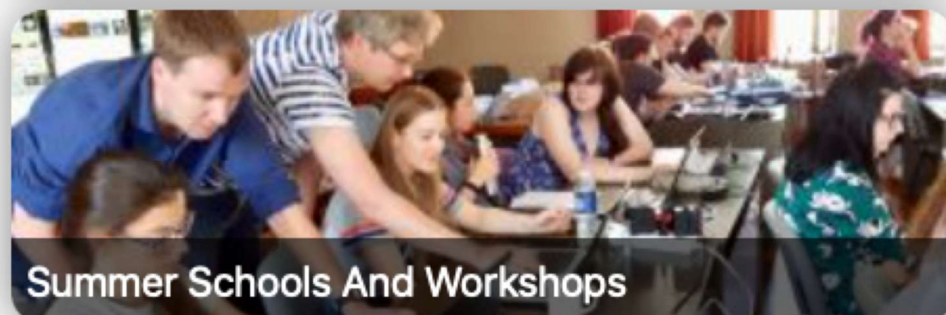
Summer Schools And Workshops